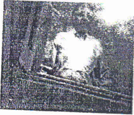
Ist Party पट्टा देने वाला

Reg. No. 9121 Reg. Year 2010-2011 Book No. 1