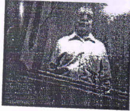
IInd Party पट्टा लेने वाला